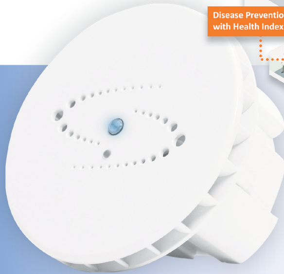
HALO Smart Sensor is Patented.