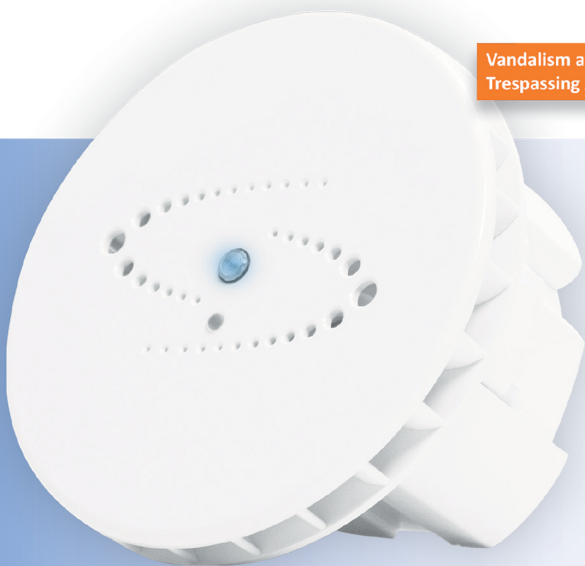
HALO Smart Sensor is Patented.